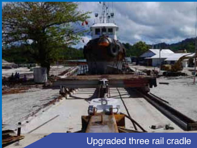
Upgraded three rail cradle