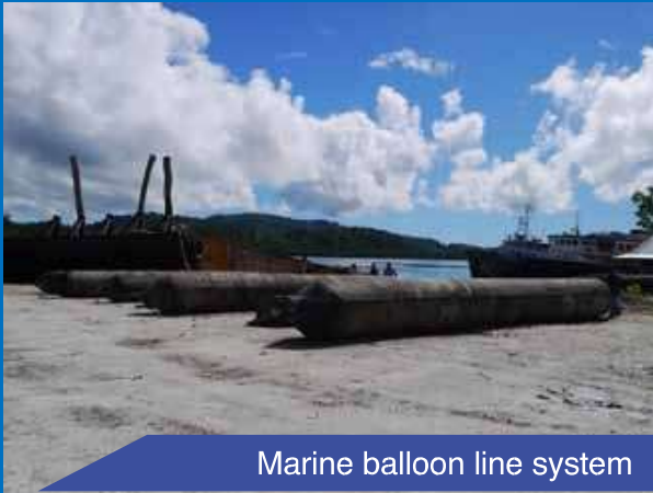
Marine balloon line system