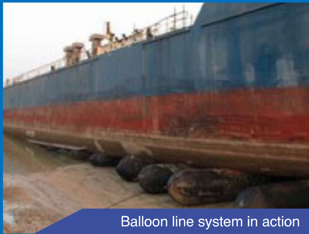
Balloon line system in action