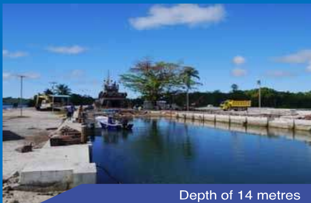
Depth of 14 metres